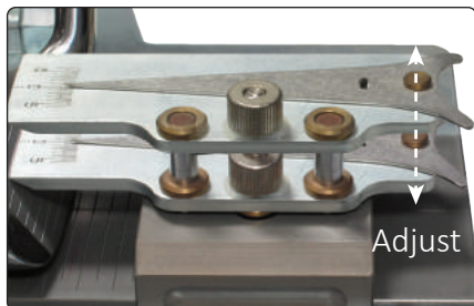
▲ Apron adjusts height wise to allow accurate face angle measurements to be made.

A lie and loft measuring gauge for fitting labs and studios. This is a highly functional and easy to use instrument built around the latest trends in clubhead design. It can manage dimensionally non-conforming clubheads with ease.