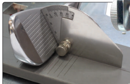
▲ Loft angle measurement on irons.