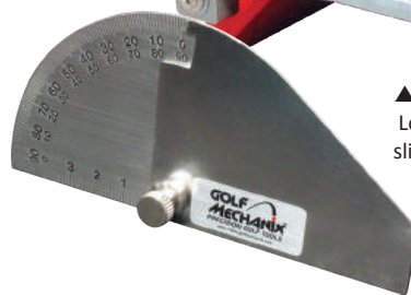
▲ Apron is mounted on Low friction precision linear slides.