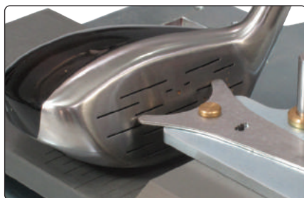
▲ The apron and base provide two reference planes from which an accurate setup can be achieved.